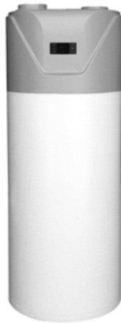
HPW200 & 300