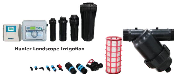
Hunter Landscape Irrigation