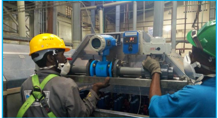
D&S Technicians on site as they install monitoring and control equipment for the factory's automated cooling system.