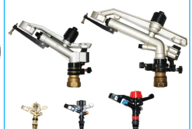
Rainguns and Sprinklers

The new and comprehensive range of Irrigation equipment and accessories now available across the D&S Group.