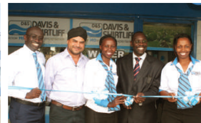
Nanyuki Branch opening