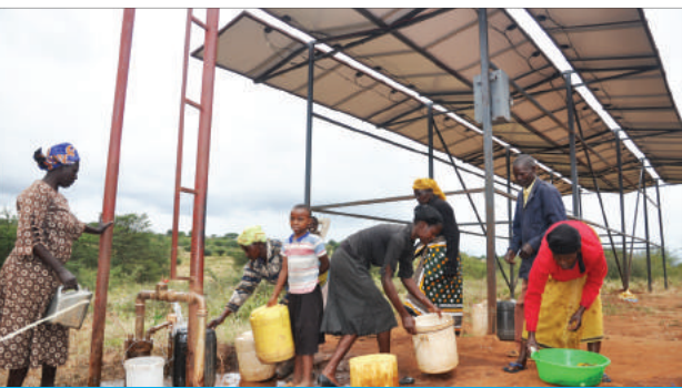
Dayliff remote monitoring solar powered borehole pump installed at Mwala

Despite its long history and market maturity Davis & Shirliff today is a technology focused company with a strategy of winning Leadership through Technology . This recognises its deep technical capacity with no regional organisation employing more qualified engineers, the opportunities available with modern digital technology and the fact that many of its products are essentially commodities and customer value can be created through technological innovation.