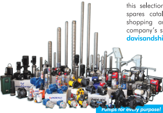
Pumps for every purpose!

this selection tools, technical data and spares catalogues as well as internet shopping are all available from the company's substantial online presence at davisandshirliff.com and dayliff.com .