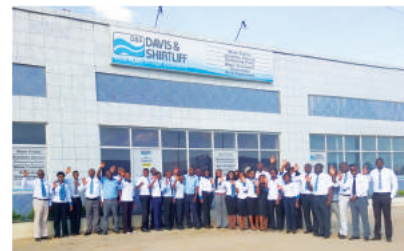
Lusaka Branch - Zambia

+254 737 557755 | ramcoprinting.com | RamcoPrintingWorksLtd