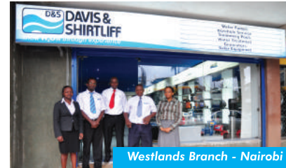
Westlands Branch - Nairobi

In order to better co-ordinate resources, the company has invested heavily in its IT infrastructure with a real time centralised ERP system being used regionally and with all system development being done