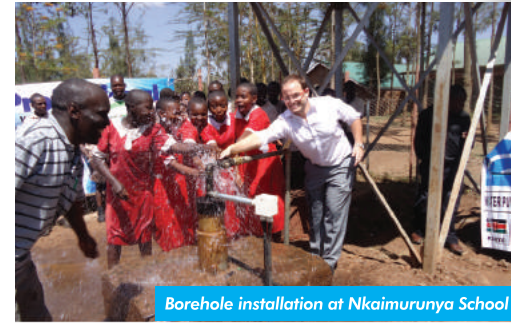
Borehole installation at Nkaimurunya School

much can be achieved with relatively small investments, the provision of accessible and safe water supply making such a huge impact on people's lives. By working together with its various partners, Davis & Shirliff has already made a considerable contribution and is determined to increase its community activities in the future.