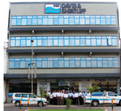
A view of the newly opened Mombasa head office.

In this internet driven age of universal information product differentiation has become increasingly difficult to achieve, which has been a great benefit to the consumer in terms of much reduced pricing. The key market differentiators