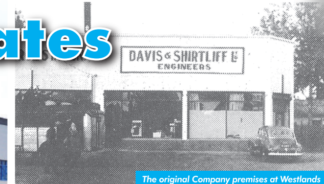
The original Company premises at Westlands