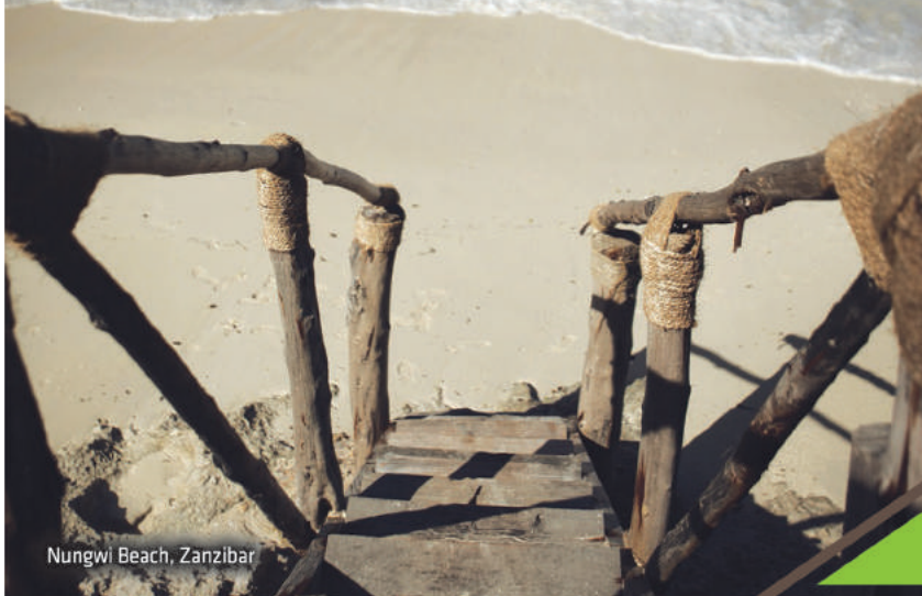
Nungwi Beach, Zanzibar

CBA congratulates Davis & Shirliff Group on their 70th Anniversary.