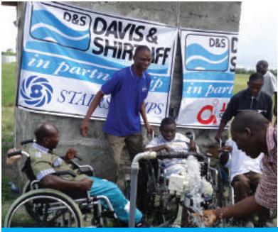
Borehole installation at Handicapped Community Fellowship Ministry

For any company or individual who achieves a degree of success and prosperity, there comes an equal measure of responsibility and a duty to give back to the society to which they belong. For Davis & Shirliff this is an important priority and for many years it has had a CSR programme of assisting needy institutions with donated water and energy solutions, it being estimated that over one million people have benefited. This is organised by a volunteer staff committee who put in considerable time identifying and executing projects and for