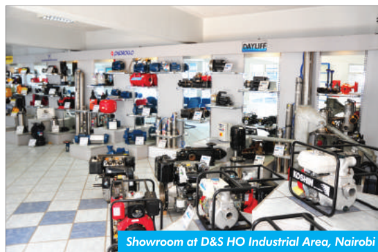
Showroom at D&S HO Industrial Area, Nairobi

Certikin and Midas plus a range of locally manufactured items. The strategy has been most successful and Davis &