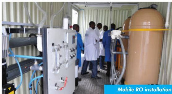
Mobile RO installation

As well as unparalleled functionality and convenience for the user, innovative monitoring systems like iDayliff allow D&S engineers to minimise equipment failure more effectively through preventative maintenance and rapid response. Customers choosing a D&S service contract with iDayliff will have their equipment monitored 24hrs/day so that should a failure occur, a maintenance team can be despatched even before the fault becomes evident to the user. Similarly, should the system detect any anomaly, maintenance can be scheduled to avoid any catastrophic failure in the future.