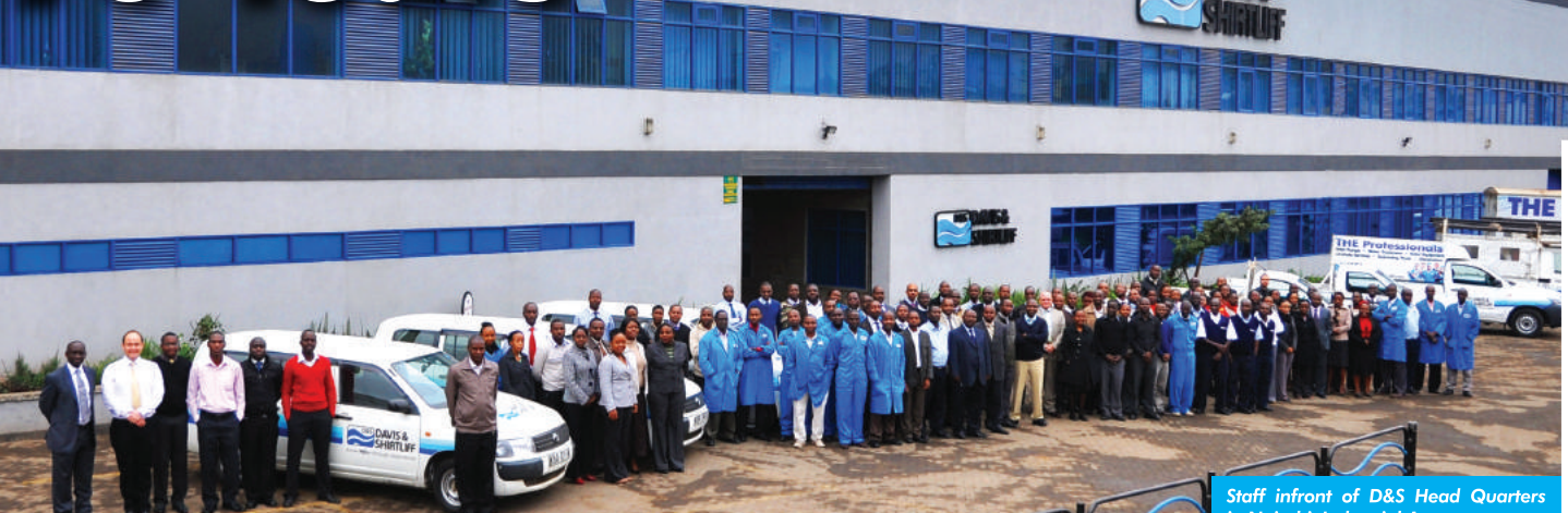
Staff in front of D&S Head Quarters in Nairobi, Industrial Area