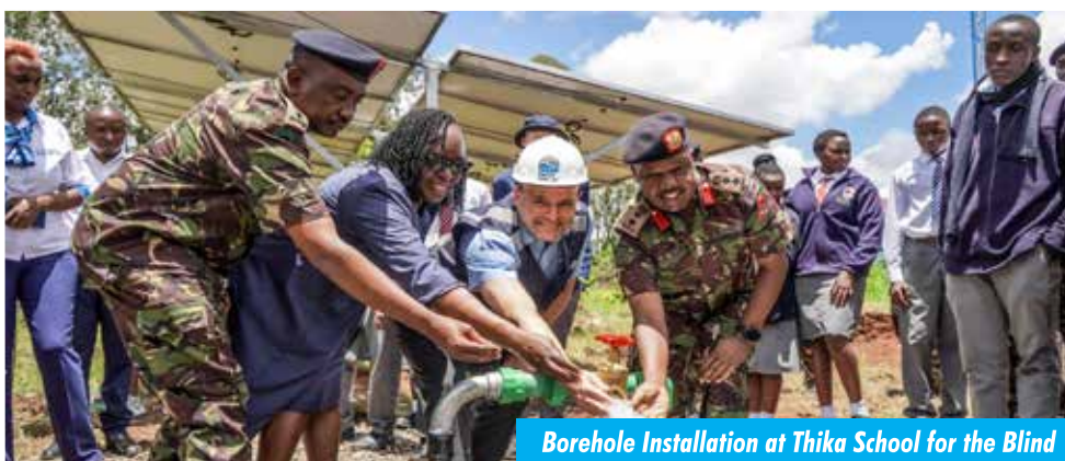
Borehole Installation at Thika School for the Blind

corporate and donor organizations, notably Britam recently, and whose support is much appreciated. These photos are just some of the heartwarming moments of impact that have been experienced through the initiatives of which D&S is justifiably proud.