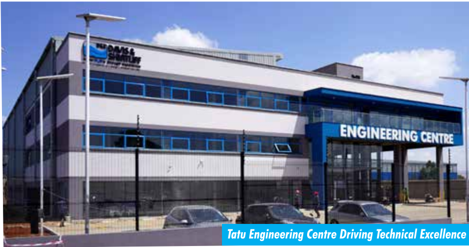
Tatu Engineering Centre Driving Technical Excellence

An exciting recent development for the D&S Group has been the establishment of a dedicated Engineering Centre at Tatu City. This specially designed facility includes a large manufacturing area, assembly workshops, an R&D activity, a certified water testing laboratory, meeting and training rooms, and extensive office space. The building is also eco-friendly with solar and battery power supply, high purity water treatment and through ventilation to create an exceptionally comfortable working environment. This facility is unique in the region and will concentrate on