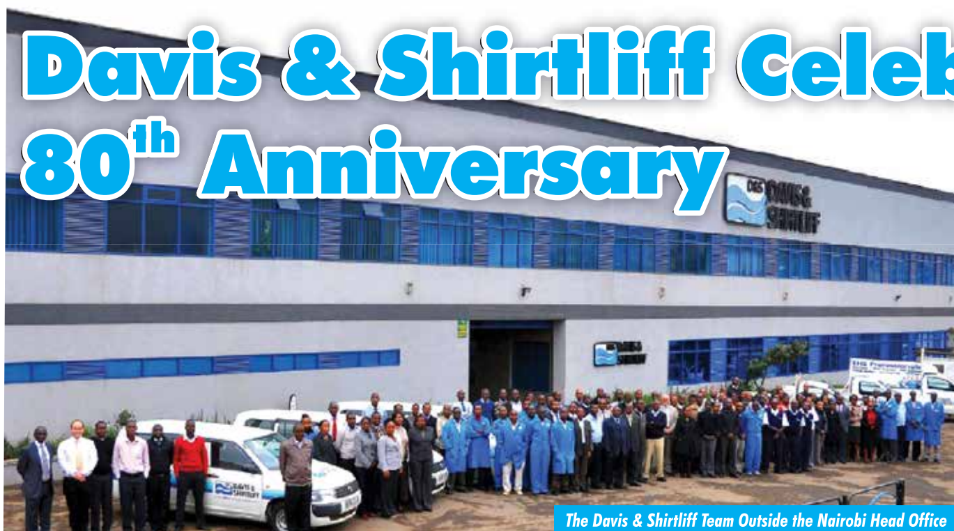
The Davis & Shirliff Team Outside the Nairobi Head Office