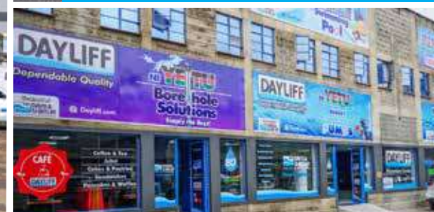
The Modern Customer Centre at the Nairobi Head Office