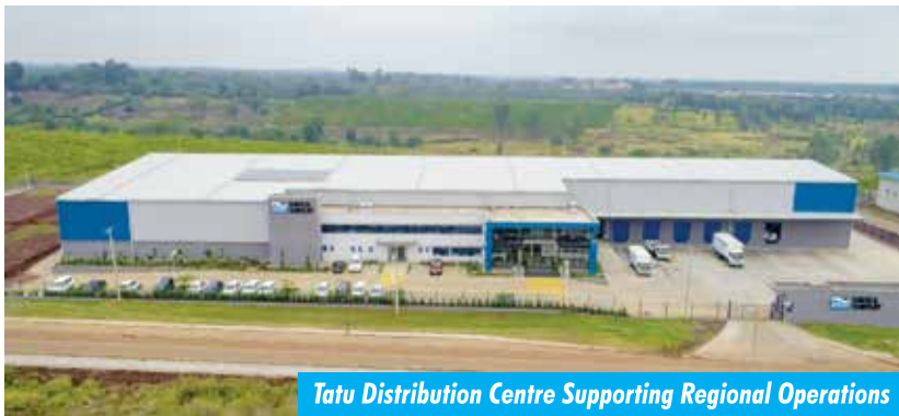
Tatu Distribution Centre Supporting Regional Operations

The Tatu Distribution Centre is a major strategic investment by the D&S Group being the central stocking hub providing excellent service levels to its wide regional operations. It makes a big contribution to the D&S Group's purpose of 'Improving Lives' through better access to the essential products and expertise that it supplies and the company is very proud this world class facility that represents the standards and aspirations of the D&S Group.